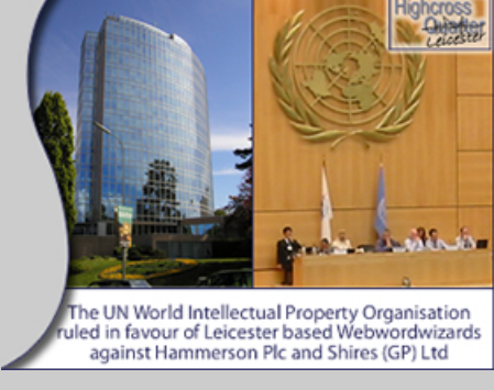
The UN World Intellectual Property Organisation ruled in favour of Leicester based Webwordwizards against Hammerson Plc and Shires (GP) Ltd

£350 million pound shopping centre) "Highcross Quarter". A name that as High Cross Quarter ... lo and behold... had an established generic meaning in Wicca as the highpoints on the wiccan calendar. Clearly, Hammerson simply did not do their homework!