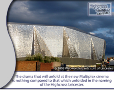
The drama that will unfold at the new Multiplex cinema is nothing compared to that which unfolded in the naming of the Highcross Leicester.

A website to explain what the Highcross Leicester is and how the Leicester £350 million highcross brought our clients and us to worldwide attention in what is undoubtedly the highest profile internet name dispute of all time.